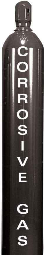
Hoses for Following Gas