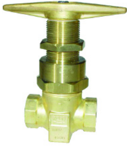
PANEL MOUNT VALVE

The 9560 series high pressure shut-off valves are designed for heavy duty use on manifolds, tube trailers and other high pressure piping systems. These valves are suitable for use with oxygen, acetylene, nitrogen, argon, helium, hydrogen, carbon dioxide, nitrous oxide and other inert gases.