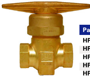
STANDARD BONNET VALVE

3/4" F.NPT master shut-off valve for all gases