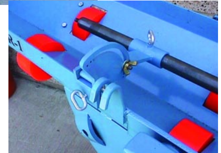
Two Cylinder Roller