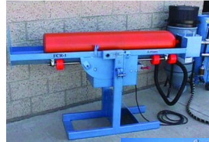
Single Cylinder Roller

Unit comes with safety bar to prevent possibility of cylinder falling forward as table moves from horizontal to vertical position. Limit switches will prevent unit from operating if safety bar is not in place. Can handle 10 5/8" Dia. by 68" tall ( cap included ) or scuba size cylinders.